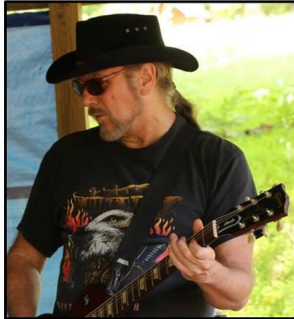
Live Entertainment by