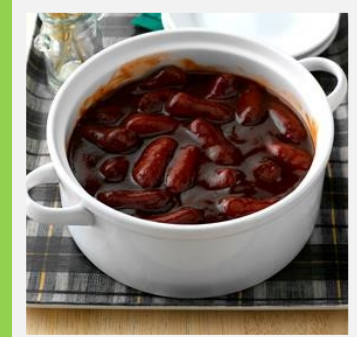
Slowed-Cooked Smokies Recipe