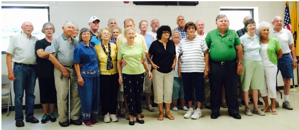
Volunteer Recognition at the Pilot Mountain Nutrition Site

YVEDDI Senior Enrichment Services and RSVP partnered to conduct volunteer recognitions and training in July and August.